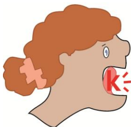
Figure 1. Katie, visualizing the /k/ sound.

The visual cues provided by ADD (Lindamood & Lindamood, 1984) have been shown to be effective in increasing phonemic awareness and discrimination between sounds. The child must then discern the relationship between sounds and letters to utilize the alphabetic principle. The relationship between phonemes and letters is not obvious from the shape of the letters. A program designed to make this relationship more transparent is termed Phonic Faces (Norris, 2001). The Phonic Faces alphabet is designed to associate the shapes of alphabetic letters with speech sound production cues (an approach that directly exploits the language foundation of the alphabetic principle). Each phoneme, including the 15 vowels of English, is represented by a unique face. By imitating the speech production cues shown in the faces, the associated sound is produced. This approach integrates the visual attributes of the letters with the auditory features and kinesthetic production cues of the related phoneme. For example, Figure 1 shows the Phonic Face Katie representing the /k/ sound.